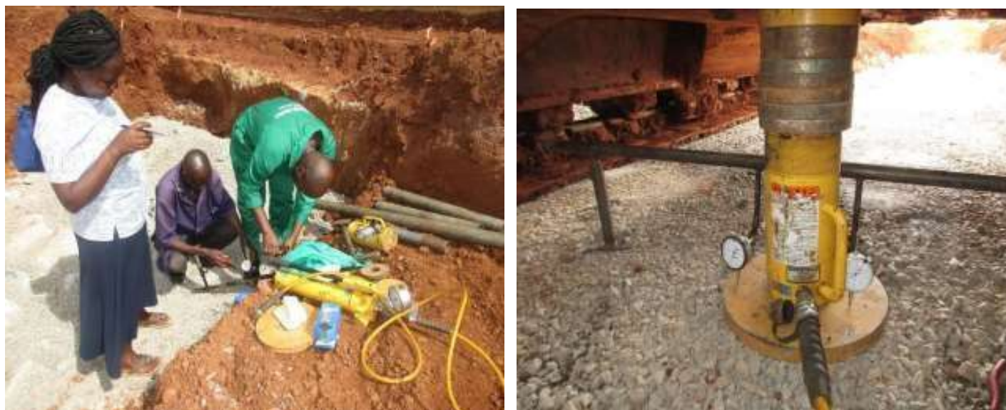
Plates 2&3: The plate load equipment