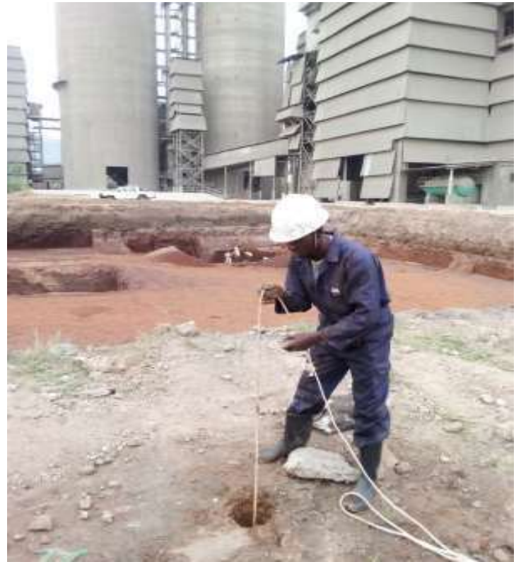
Taking the level of water table for a drilling site at Tororo Cement Factory