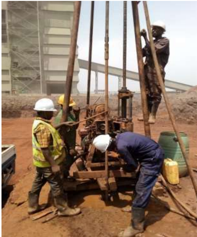
Geotechnical Drilling at Tororo Cement Factory