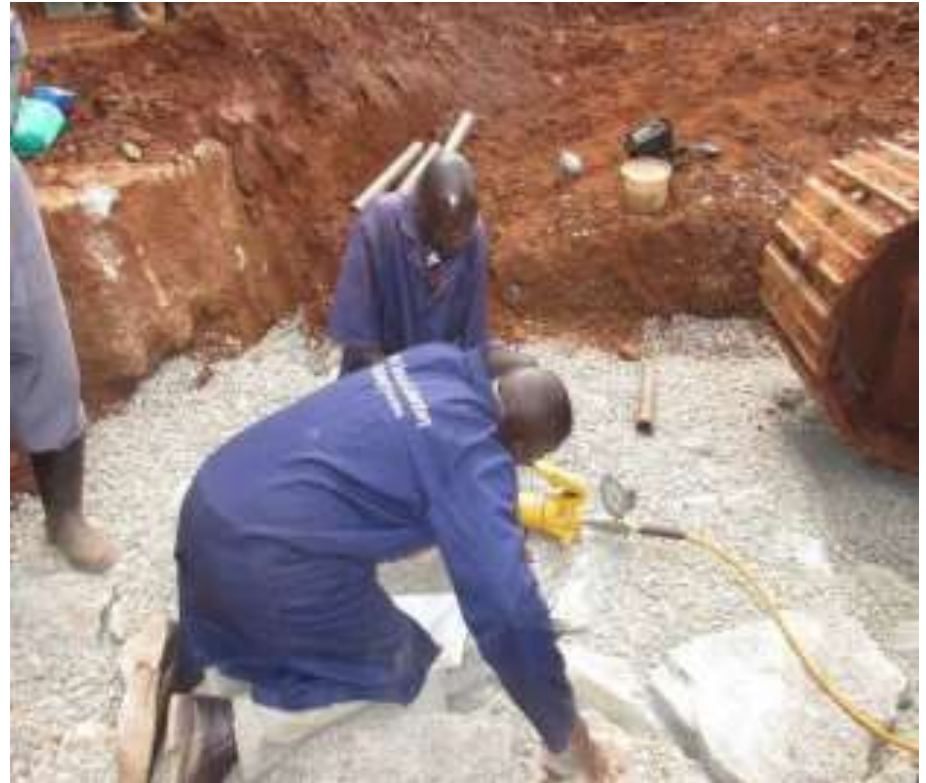
Plates 4&5: Taking the dial gauge readings after applying the loads