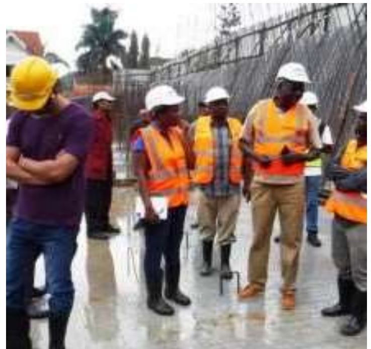
A multi-disciplinary and multi-cultural team is a good blending for a successful site, 2018