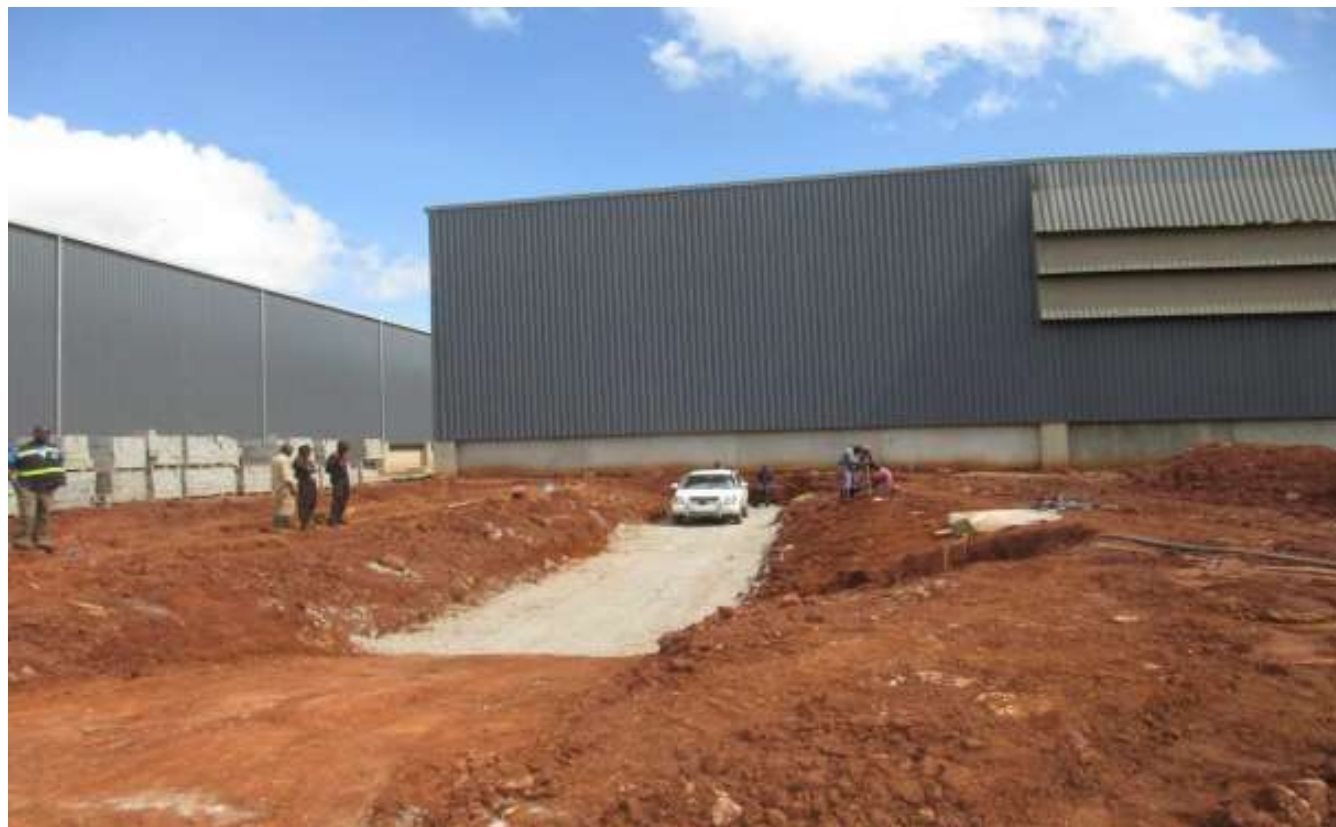
Plate 1.0: Proposed construction site to be tested

The photos below show the details of the field activity.