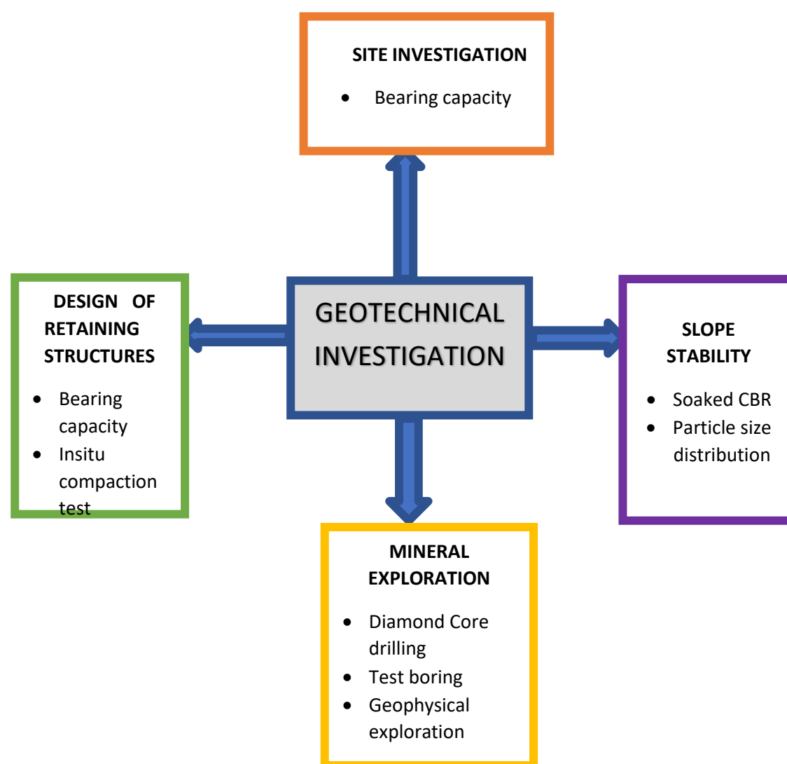
Figure-1. geotechnical Engineering

According to section 3.2.2 of the Building control regulations (2012) by Ministry of Works and Transport, Before construction activities could begin at any site, engineering geological and geotechnical investigations for foundations has to be approved in order to determine the safe bearing capacity of the soil materials and recommend suitable foundation for the structure.