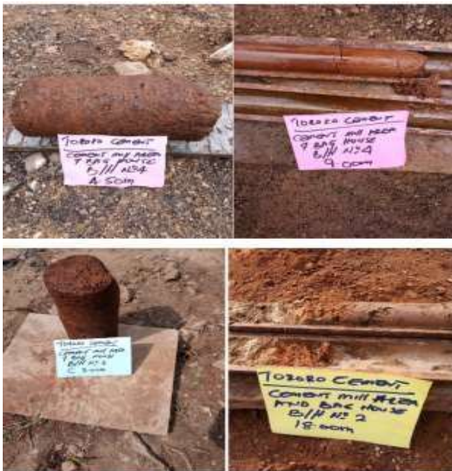
Materials samples extracted for further laboratory testing and analysis